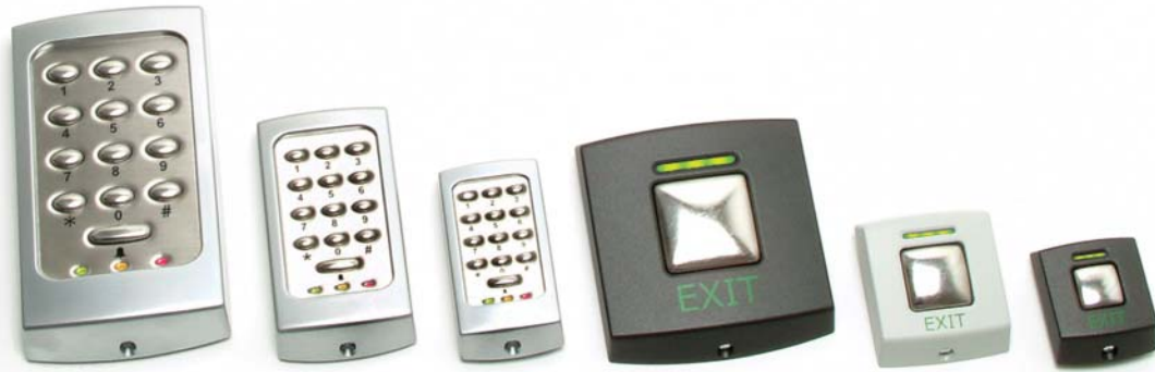
TOUCHLOCK K series stainless steel keypads