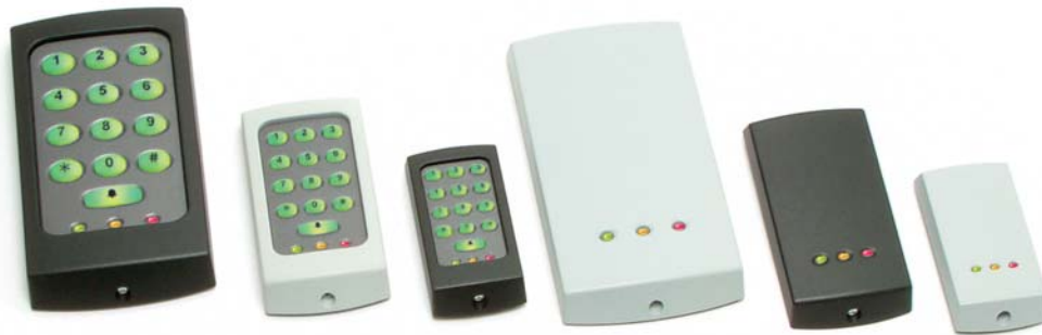
TOUCHLOCK K series keypads

Our new range of Net2 readers, keypads and exit buttons are available now. Great performance combined with stylish looks: